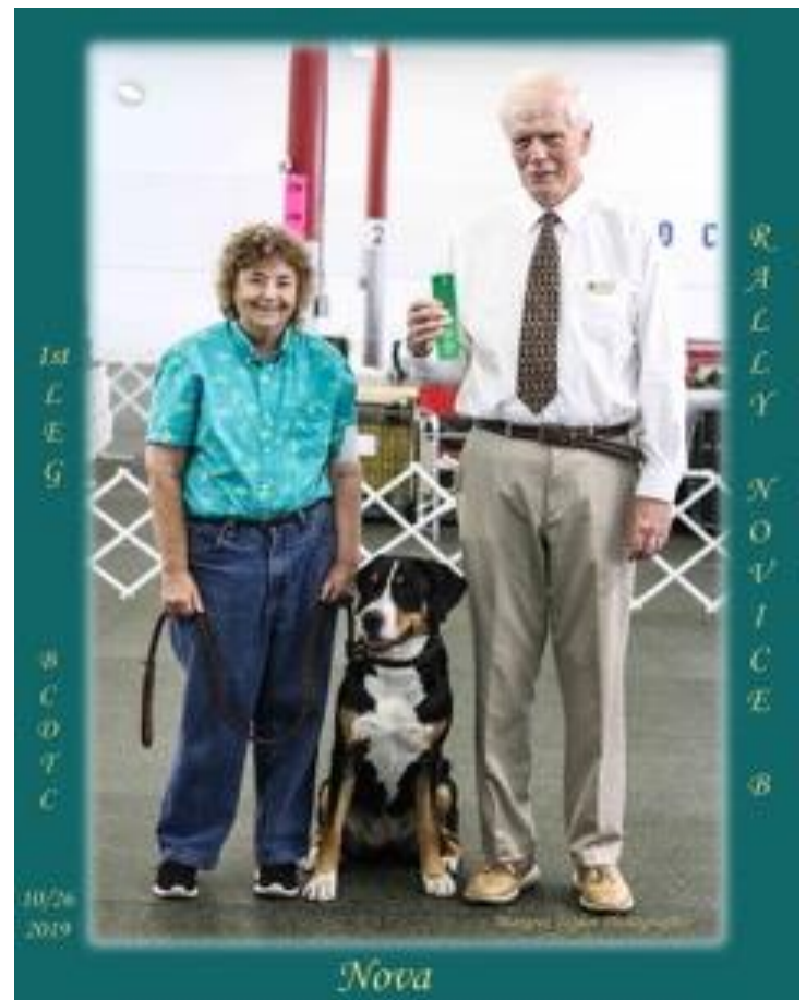
Nova got two qualifying legs and a Fourth place in Rally Novice B at Brevard Country DTC trial held in Daytona Beach, FL.