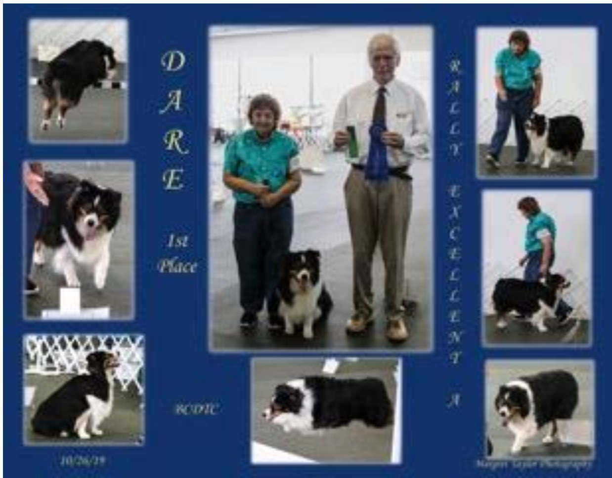
Here's Dare getting first leg in Rally Excellent A at Brevard Country DTC trial held in Daytona Beach, FL.