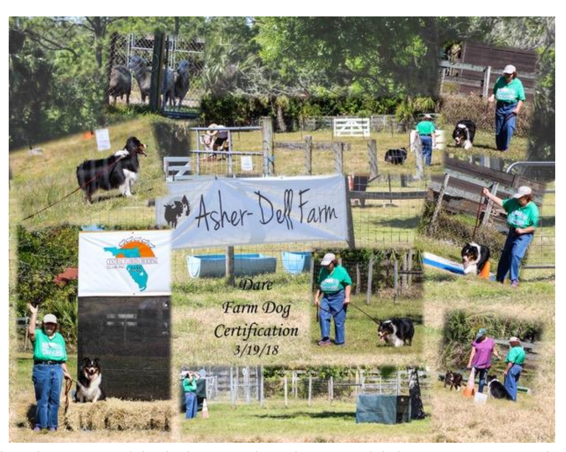
I'm pleased to announced that both Dare and Que have passed their Farm Dog Test. "What is the Farm Dog Test?" you may ask. Well, it's like a CGC with live farm animals such as ducks and sheep in a farm like environment. The whole test is done on lead and it's totally fun. Everyone should try it. What's next? Why, Ranch Dog Test of course!